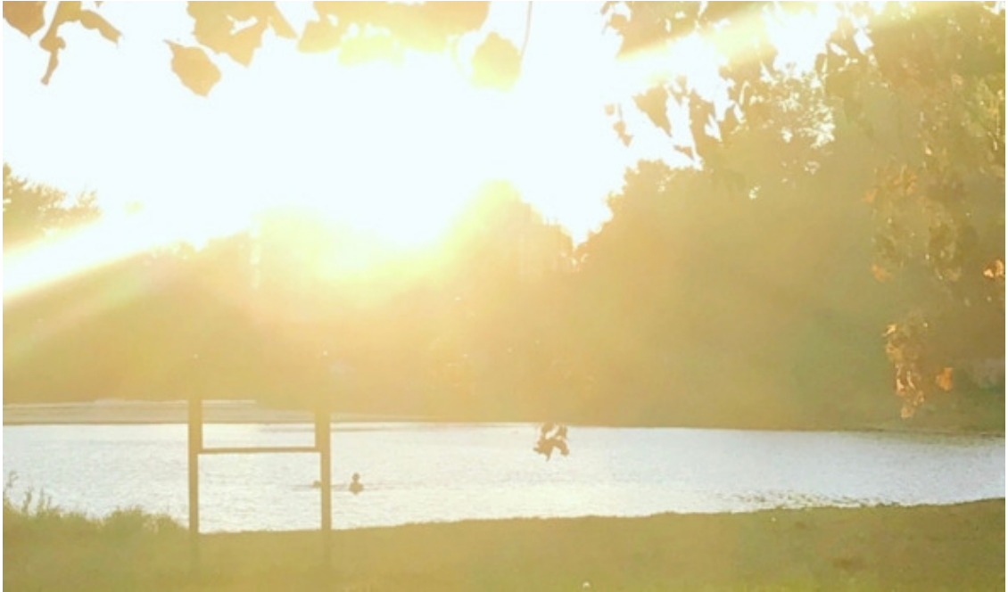
Saint Petersburg, Petrovsky Island.

O garden green, your verdant mane, The earth breathes warmth beneath our feet. We need help now, more than ever — Where kings rule, the meek must plead.