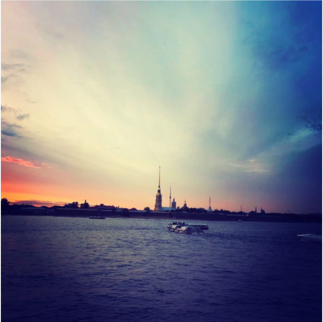
Saint Petersburg, view of the Peter and Paul Fortress, 07.06.2018.

I long to breathe the depths of quiet speech, To fill my soul with love and gentle heat, To glimpse that long awaited moment's grace Where I might find the home that feels complete.