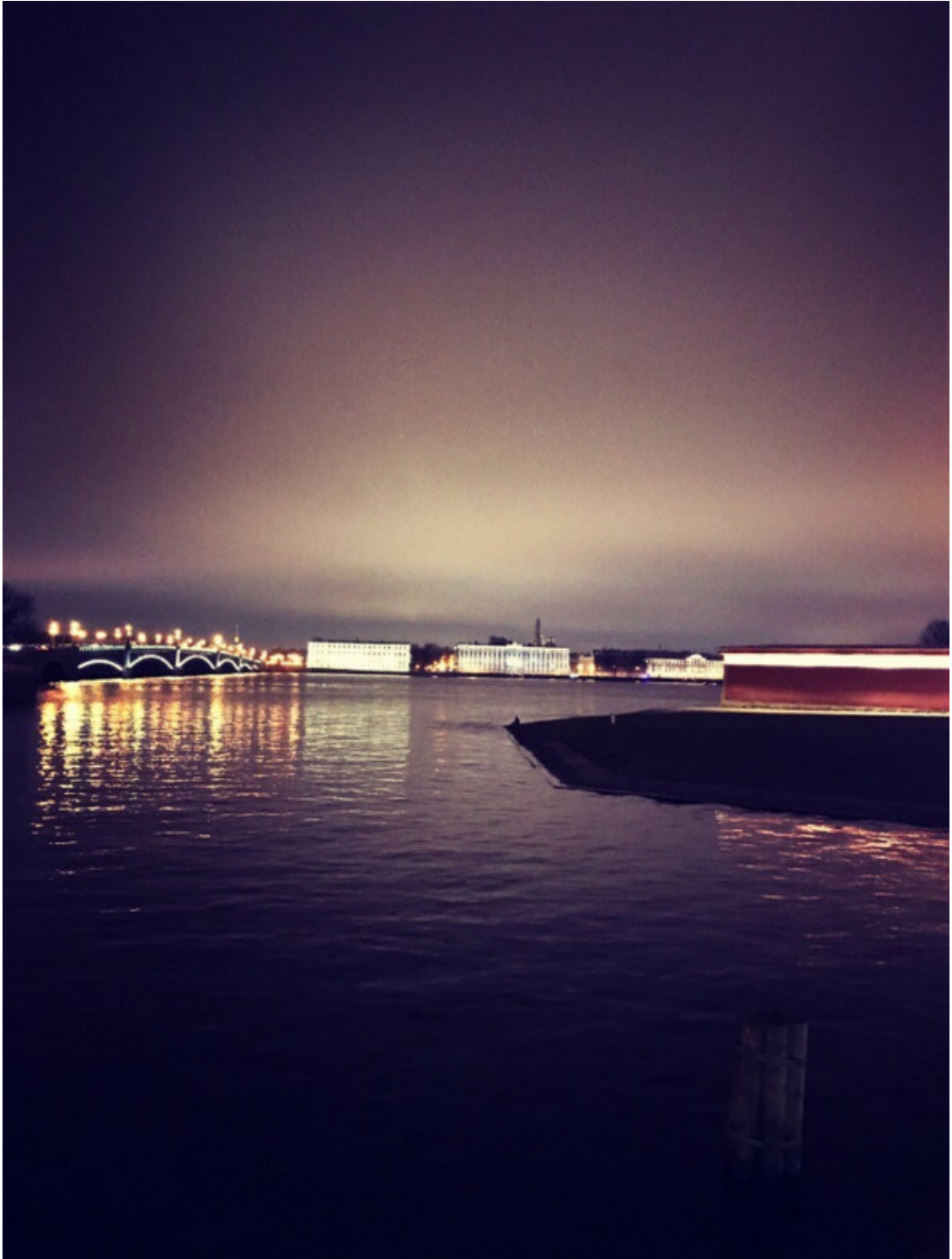
Saint Petersburg, 2019.

She doesn't sleep at night, it's true, Seeking answers, watching through. How to tell what's real, what's fake? Where's the trap, for rest to take?