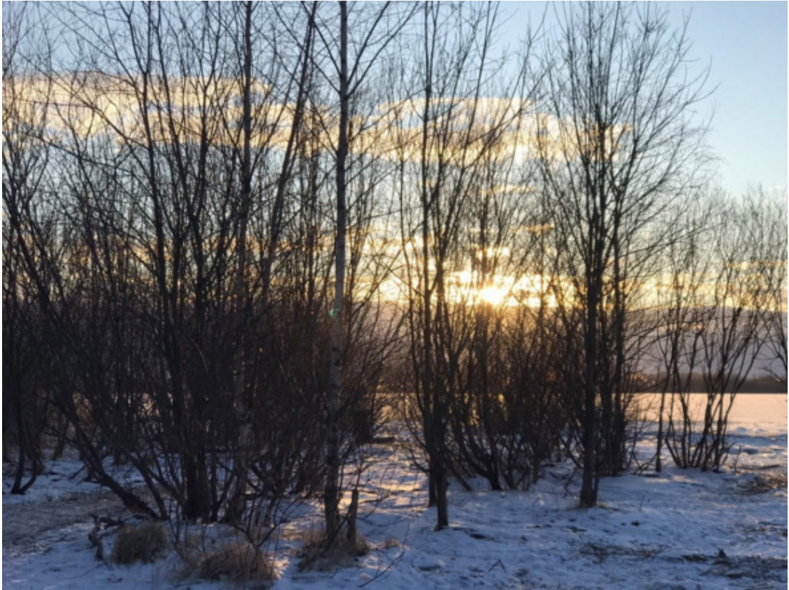
Saint Petersburg, Shuvalovsky Nature Reserve, 2020.

White snow kisses my cheeks so softly, Falls to earth with a laughing sigh. Tonight I long for you only — You have broken what once was our tie.