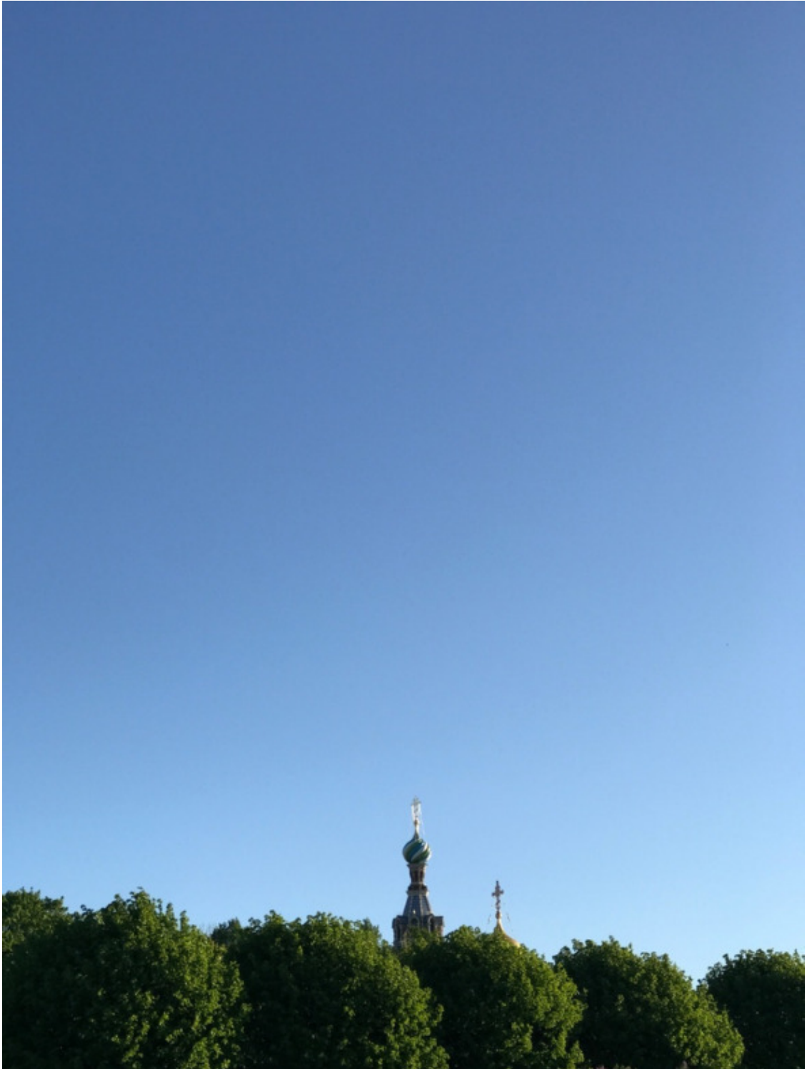
Saint Petersburg, Church of the Saviour on Spilled Blood (Spas na Krovi), 2021.

Blessings on this Sunday bright, Blessings in the morning light, Blessings to protect our souls,