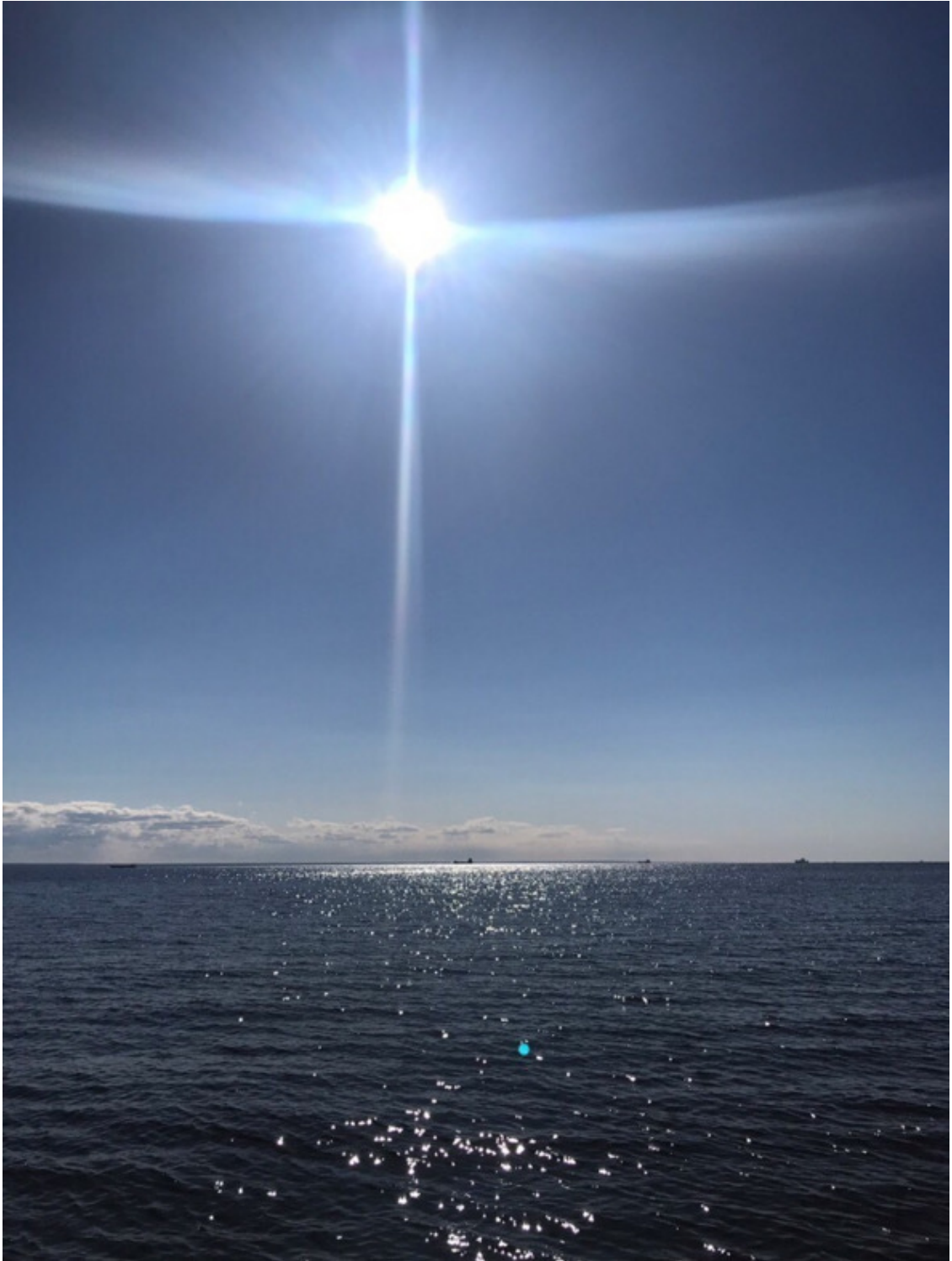
Kronstadt, Kotlin Island, 2017.

Love may fade and lose its light, But it will never disappear from sight. When your heart burns bright and true, You know the soul is shining through.