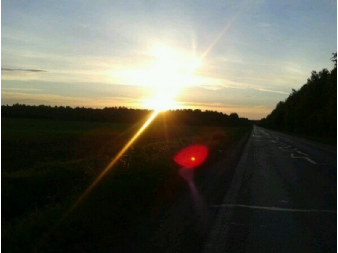
Sosnogorsk — Ukhta, Yuger settlement, Komi Republic, 2012

Once God sowed a seed with care, On fertile ground, in the land. Time flew so swift, like nothing else, With wondrous awe, so grand.