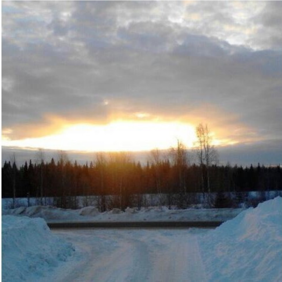
Mesyu Village, 2015

This morning whispered to me, “Live in peace, take it slow”. It didn't know, couldn't see What I'd been through in the night's glow.