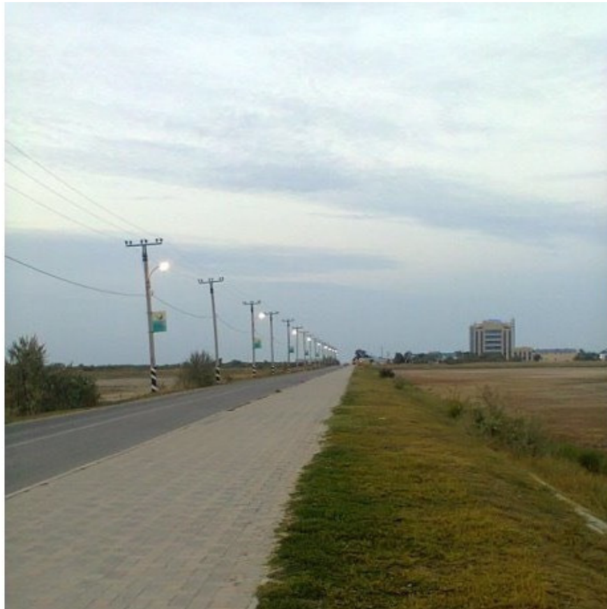
Blagoveshchenskaya Stanitsa, 2015.

I learned what I should never know, I saw what wasn't meant for me to see. Now a path is laid within my heart below — To spread the Good News, bold and free.