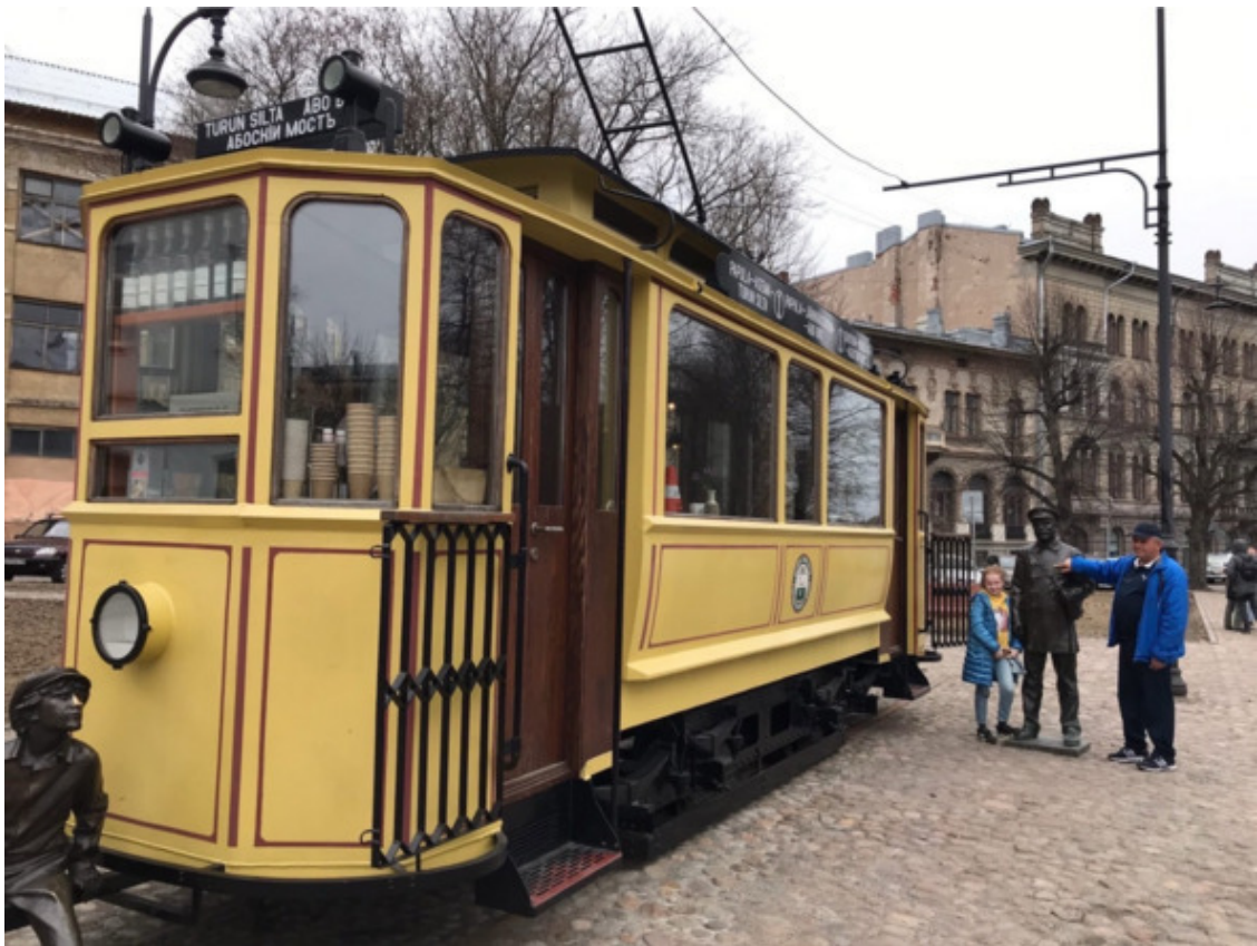
Vyborg, 2021.

Who's young, who's old — life's just one ride; Who's stern, who's kind — we all bear a price.