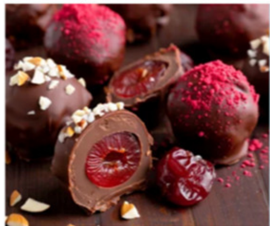
Almond-Cherry Dark Chocolate Truffles