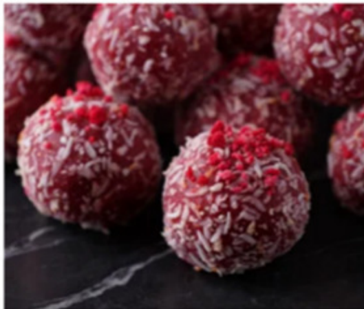
Red Velvet Truffles