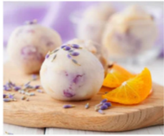
Lavender-Bergamot White Chocolate Truffles