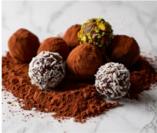
Intense Chocolate Truffles